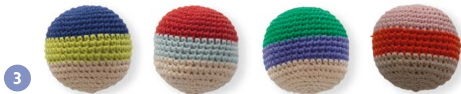
1. C0267 Crochet Balls with Beep Assorted